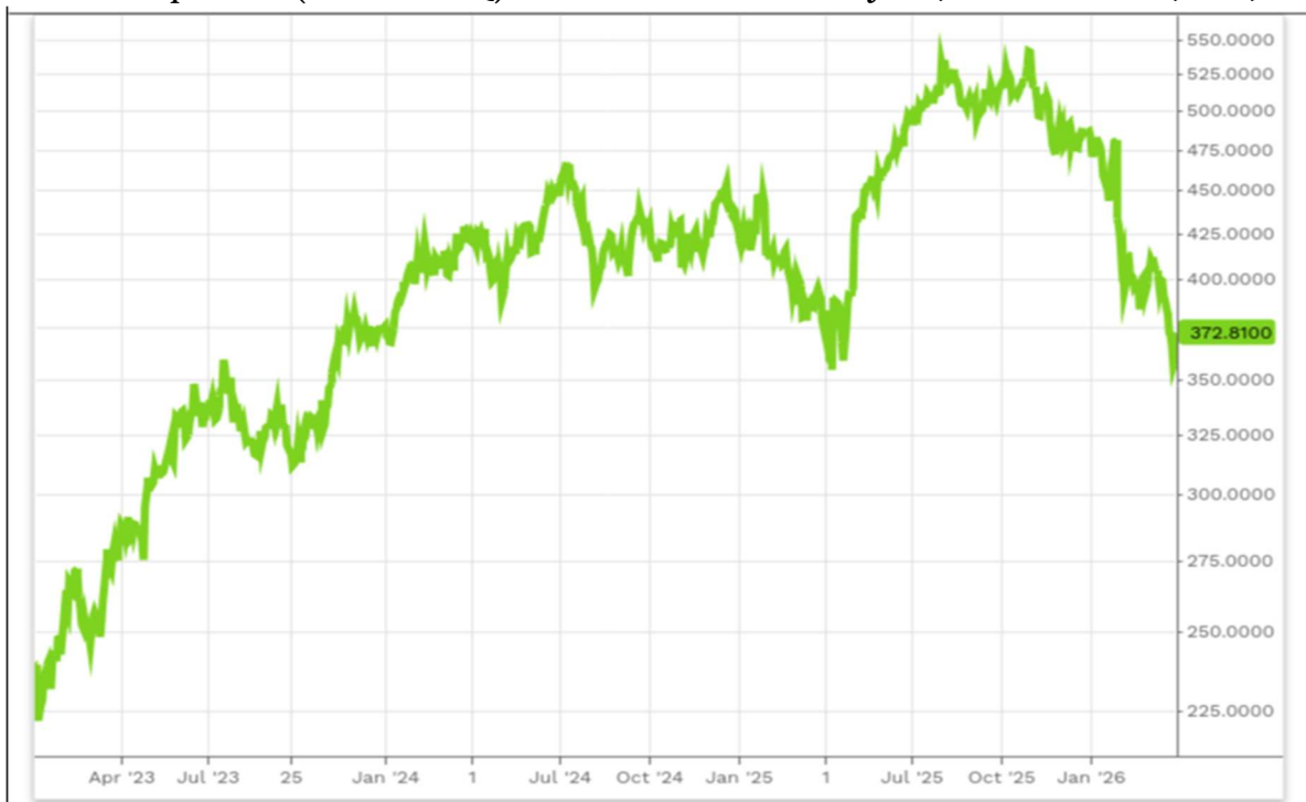
FactSet – April 9, 2026