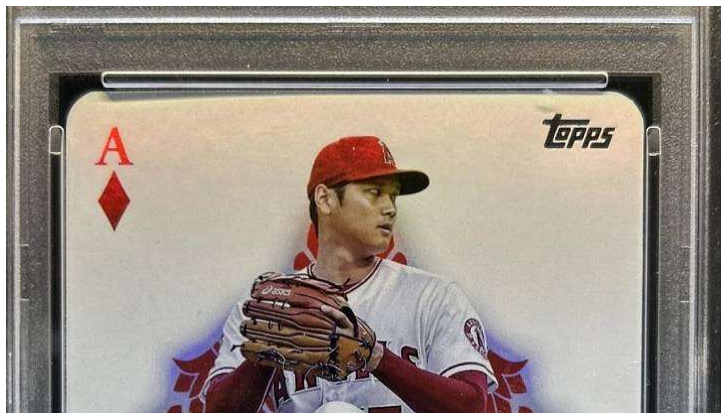
A PSA 10 2023 Topps All Aces Shohei Ohtani #AA11